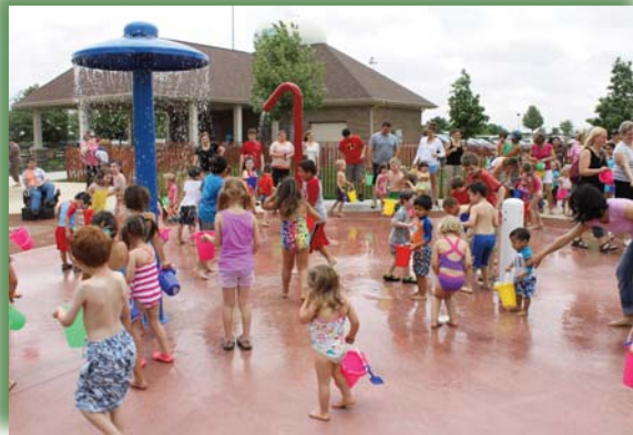
Splash Pad Grand Opening at Harvester Park

The Foundation is looking for individuals interested in promoting our vision. Your contribution is greatly appreciated and will launch our efforts of enhancing our parks and enriching our community.