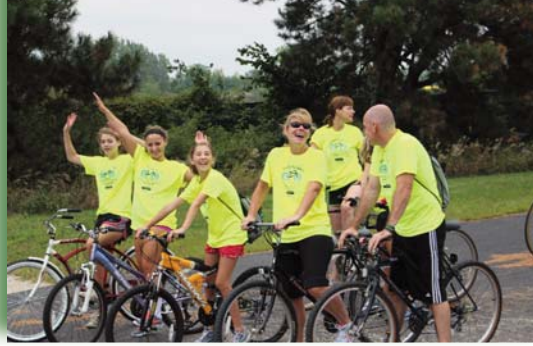
Pedaling for Fun- Pedal the Parks Fund Raiser

Visit www.brparcs.org /click on "Foundation"